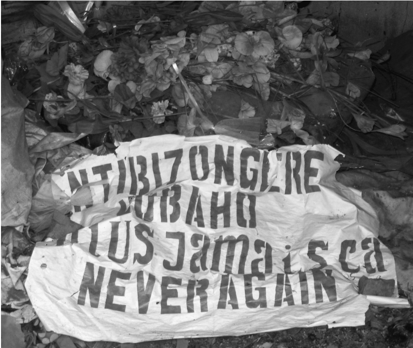
FIGURE 4. “Never again” banner, Ntarama, Rwanda.